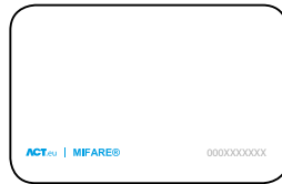
Product MF10C1 MIFARE CARD (pack of 10)