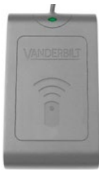
Product ACT-USB USB MIFARE Reader