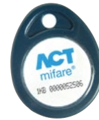
Product MF10T1 MIFARE FOB (pack of 10)